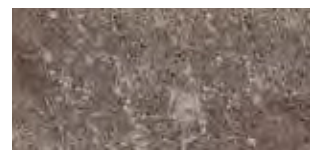
Terra Cotta Blend (T)