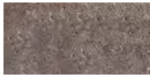
Chestnut Blend (T)