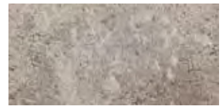
Colonial Buff Blend (T)