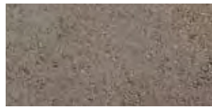
Colonial Buff Blend